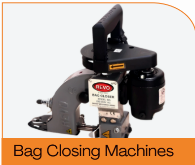
Bag Closing Machines