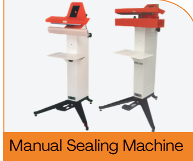
Manual Sealing Machine