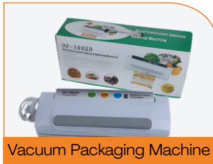
Vacuum Packaging Machine