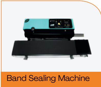
Band Sealing Machine