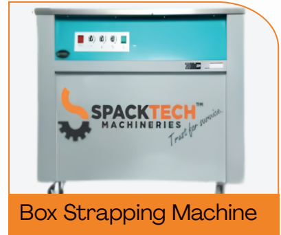
Box Strapping Machine