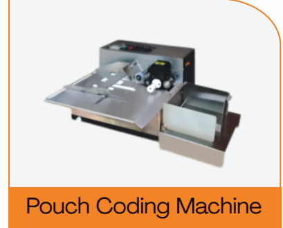
Pouch Coding Machine