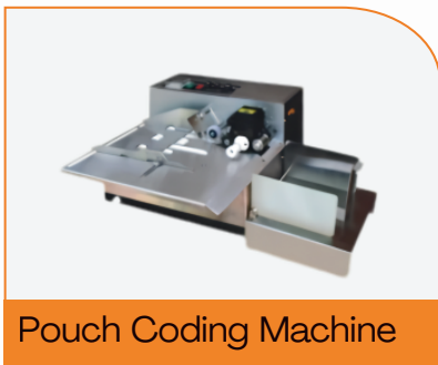
Pouch Coding Machine